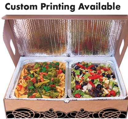
Custom Printing Available