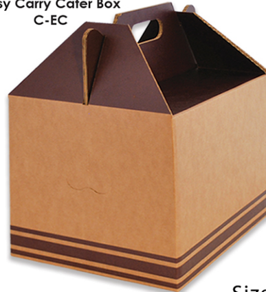
Easy Carry Cater Box C-EC