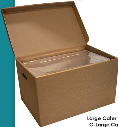
Large Cater Box C-Large Cater