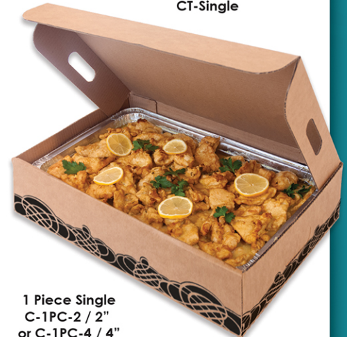
1 Piece Single C-1PC-2 / 2" or C-1PC-4 / 4"