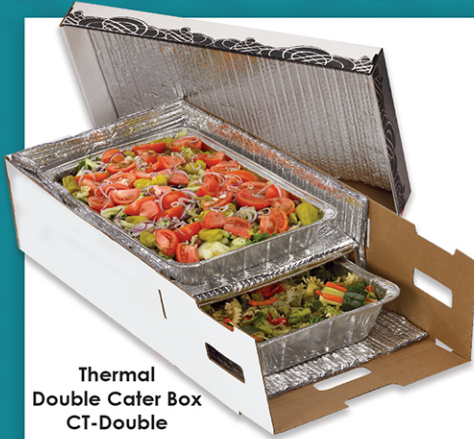
Thermal Double Cater Box CT-Double