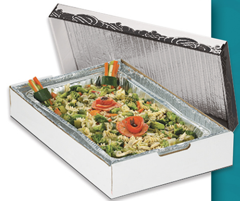
Thermal Single Cater Box CT-Single